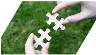
Healthcare IT News

New AMA blueprint seeks to tap the full potential of digital health